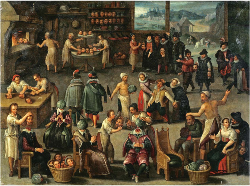
Figure 2. Cornelis van Dalem and Jan van Wechelen, The Baker of Eeklo , 1530–73. Flanders. Amsterdam, collection of the Rijksmuseum, currently on loan to the Muiderslot.

interdisciplinary level if they are inattentive to the conceptual and/or grand narratives that guide and inform them. 106